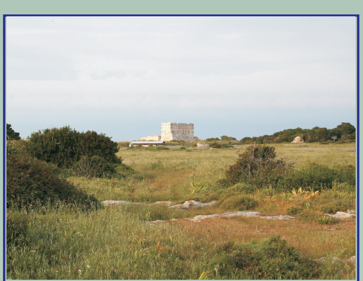
Figure 2. Study site on Strofades