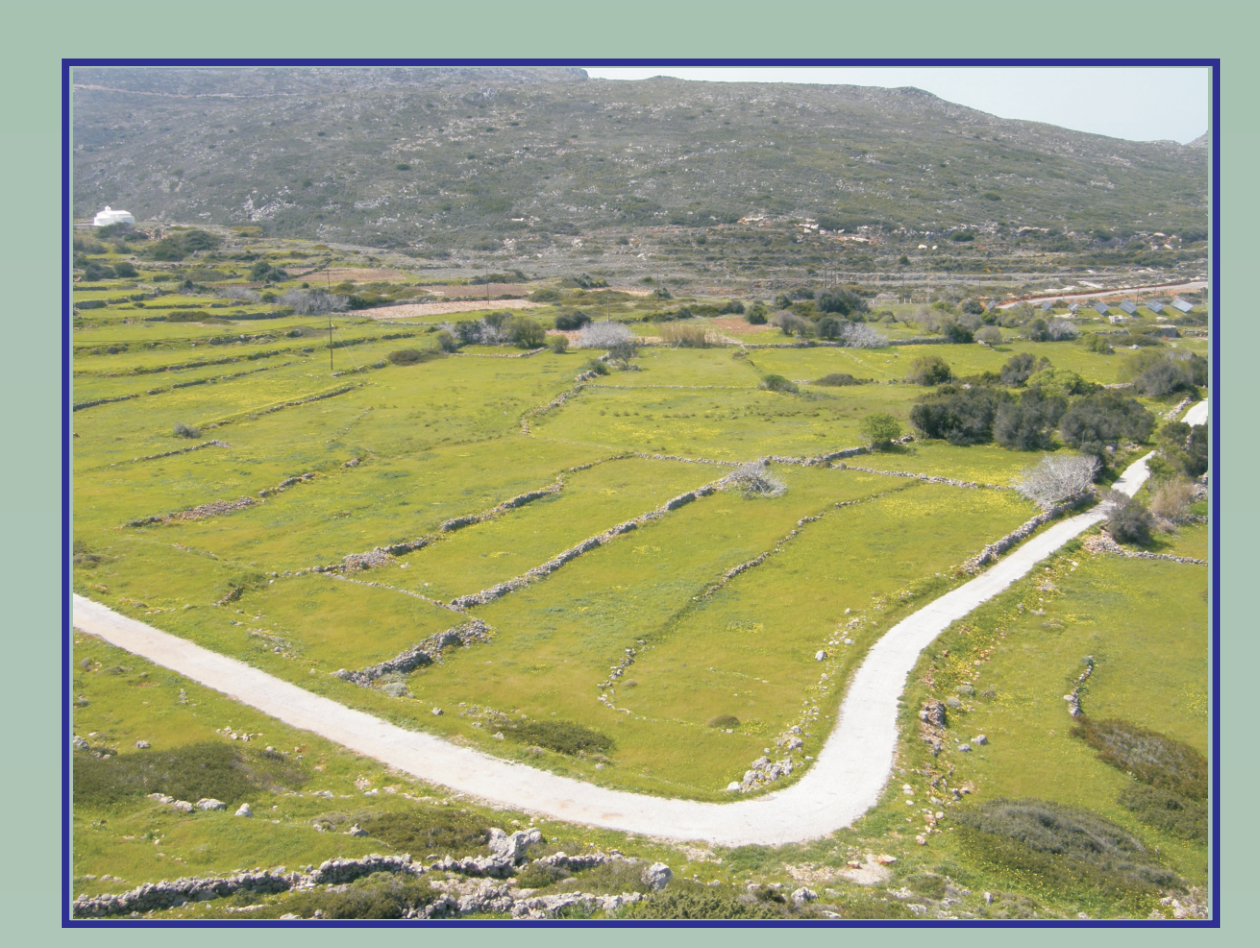
Figure 1. Study site on Antikythira.

Whereas the southward journey towards the wintering grounds has been subject to detailed investigations (cf. Bairlein 1985, Biebach et al 1986), data from spring migration, especially in the Eastern Mediterranean, are scarce (Yohannes et al. 2009). Body mass is a good predictor of fuel reserves (Biebach 1990) and it is an important indicator of the migration strategy used by different bird species. The Sahara desert and the Mediterranean Sea act as large ecological barriers and the eastern part include the largest distances for birds to cross. Data from this region is therefore necessary for a better understanding of how migratory birds manage to cross large inhospitable areas.