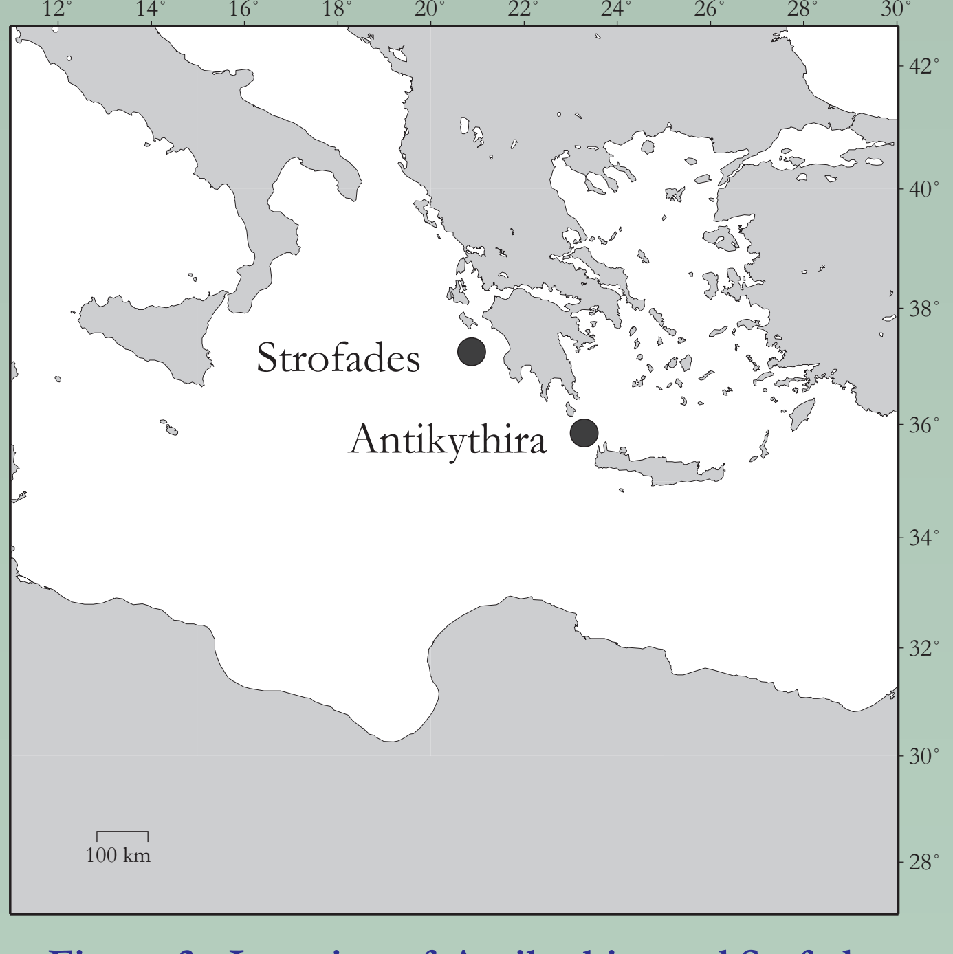
Figure 3. Location of Antikythira and Stofades.

This study deals with data on six migrant bird species from two small Greek islands, Antikythira (area of 20.4 km2) and Strofades (area of 4.0 km2; Fig. 1-3) trapped and ringed between 1st and 10th of May 2009.