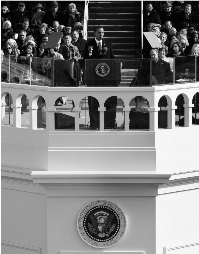
At the U.S. Capitol in Washington, DC, President Barack Obama delivers his Inaugural Address, January 20, 2009.