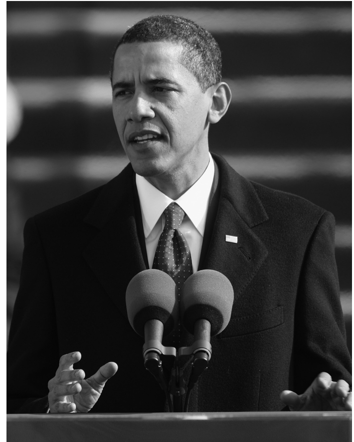
President Barack Obama makes a point during his Inaugural Address.

Now, there are some who question the scale of our ambitions,